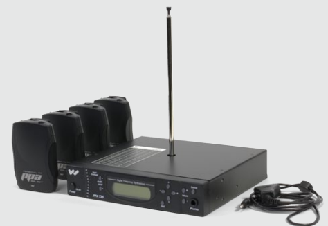
Williams Sound PPA 377 FM Assistive Listening System